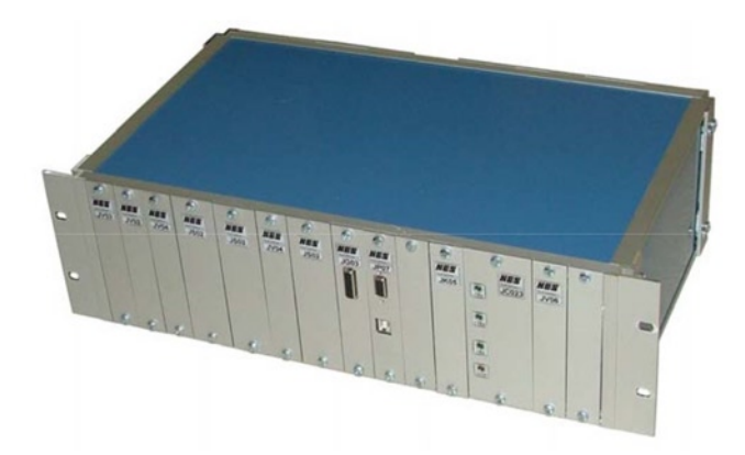
Fig. 2. Control system MORIS RV07 [32]

For determining the limit states and calculating the indicators of the so-called parametric reliability, it is important to thoroughly classify failures and determine for which failures it makes sense and whether limit states can be determined. To evaluate parametric reliability, the failures are divided according to the nature of the origin and course of processes leading to the fault.